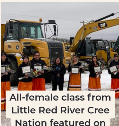
All-female class from Little Red River Cree Nation featured on CBC news.